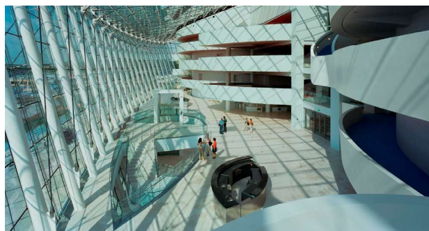
All photos on this page © Tim Hursley