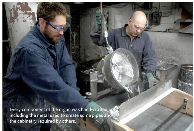
Every component of the organ was hand-crafted, including the metal used to create some pipes and the cabinetry required by others.